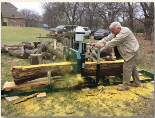
Cuts Bois-d'arc very nicely!