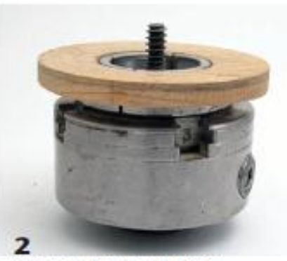
A large hardwood washer greatly strengthens the hold.