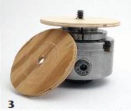
Use a plywood spacer when a smaller-depth hole is required.

back of the jaws, and then finish tightening. This will prevent any tendency for the screw to creep forward when it is being used.