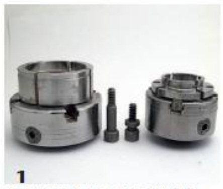
The screw on the left projects 34" (20mm) beyond the jaws. The one on the right projects 34" (16mm).