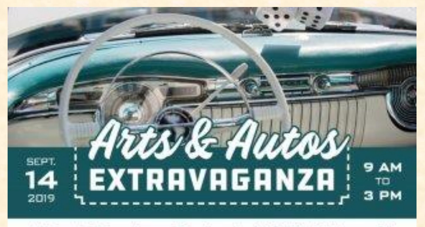
Historic Downtown Denton | 110 W. Hickory St.

Mark your calendar for September 14. GTW will be making and giving away cars to the kids. We invite all the members of GTW to come down and help with the booth turning cars, handing them out to the kids, and even taking a walk around the square to see all the different cars and venders. It is well worth the day. Even if you can only come for a few hours you will be glade you did. We will be setting up early at 7:30 and taking everything down at 3:00.