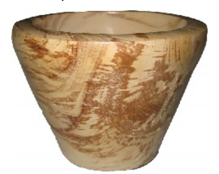
This white rot took one summer, outside, in a wood pile. No nutrients, no beer, no soil. Just nature.