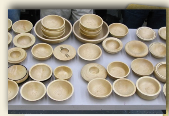
Examples of bowls fro the Empty Bowl Program.

Program. We are shooting for another 300 bowls this year. We have 26 through December. Why not join the fun. So far only 14 members have signed up. We need additional help if we are to make our goal. This year we will have bowl blanks at every club meeting to be used for the Empty Bowl Program. We have mentors that can help you learn to turn bowls. There is no reason not to participate in this worth while program.