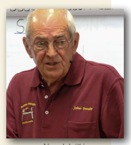
New club Shirt

If you have a shirt you want embroidered you can take it to On-The-Cuff on Dallas drive and ask them to use the GTW logo on it. (The pink building)