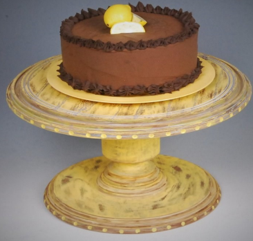
Rebecca DeGroot's Demo on mini