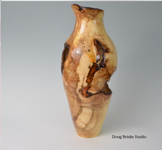
Doug Brinks Studio